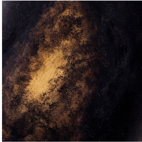
Blackened Steel with Brass Detail